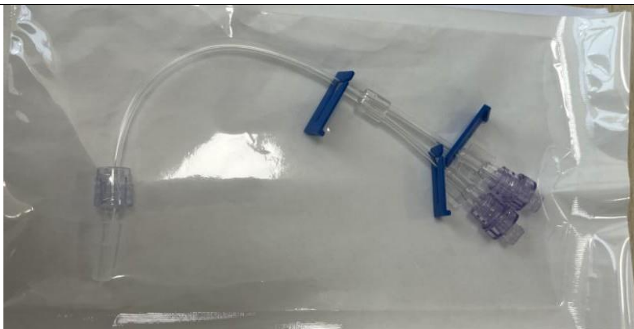
Fig.1 Packaging diagram of Disposable needle free infusion connectors